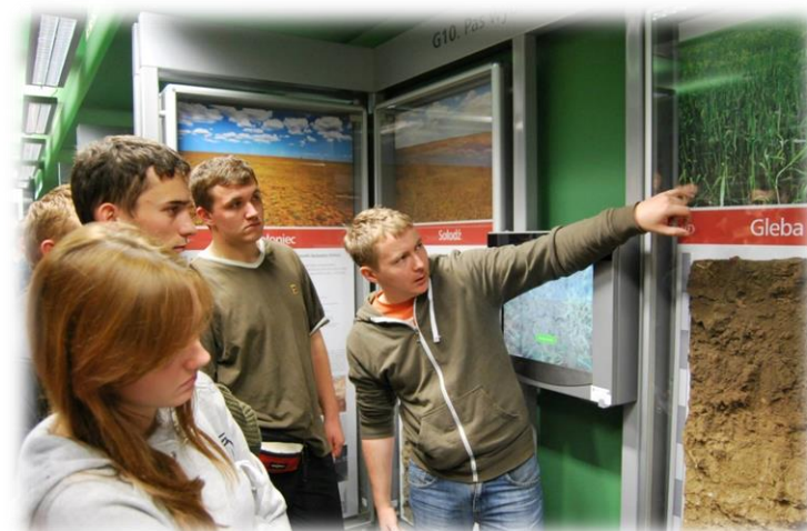
Museum of soils